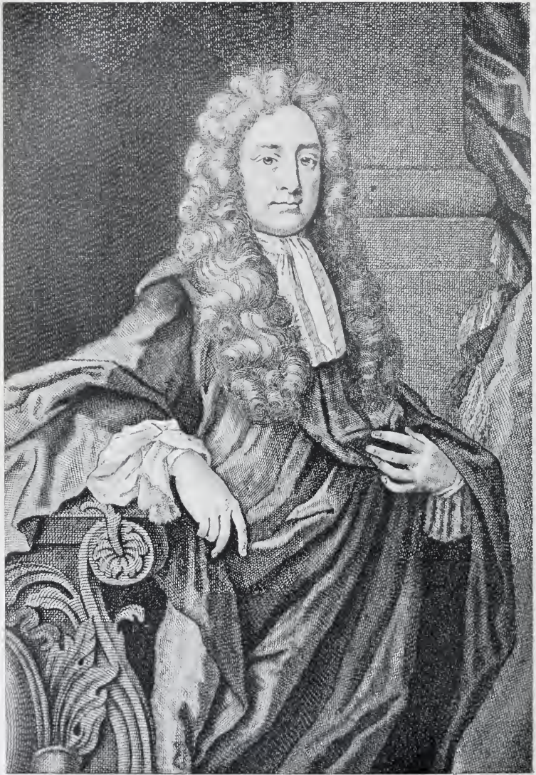
SIR JOSIAH CHILD, BART.