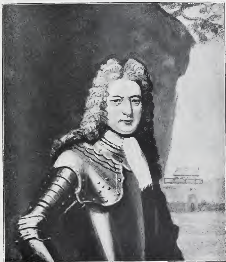
SIR STREYNHAM MASTER, GOVERNOR OF FORT ST. GEORGE (1677-81).