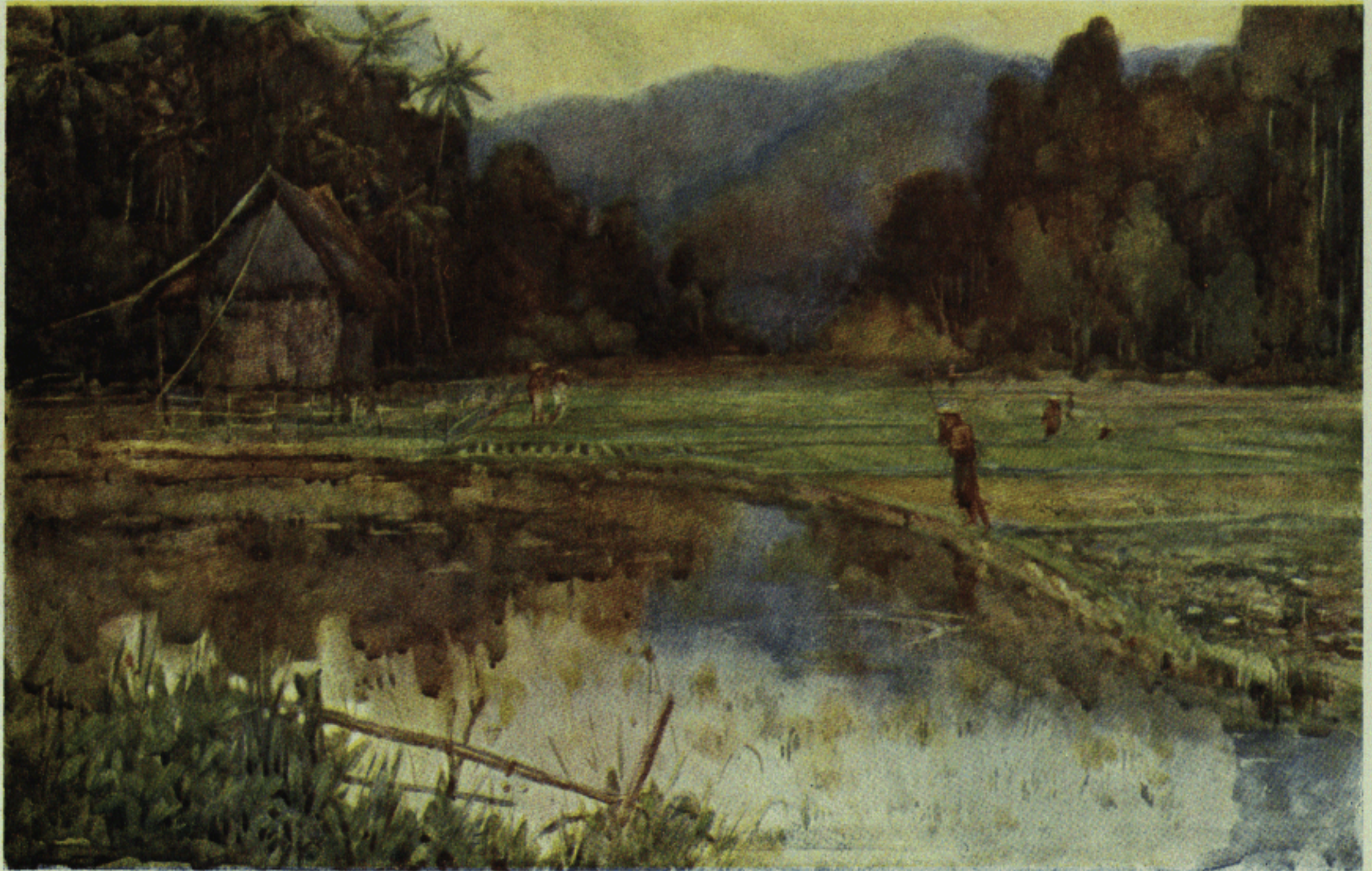
PADI FIELDS AT PANTAI, NEAR SEREMBAN.