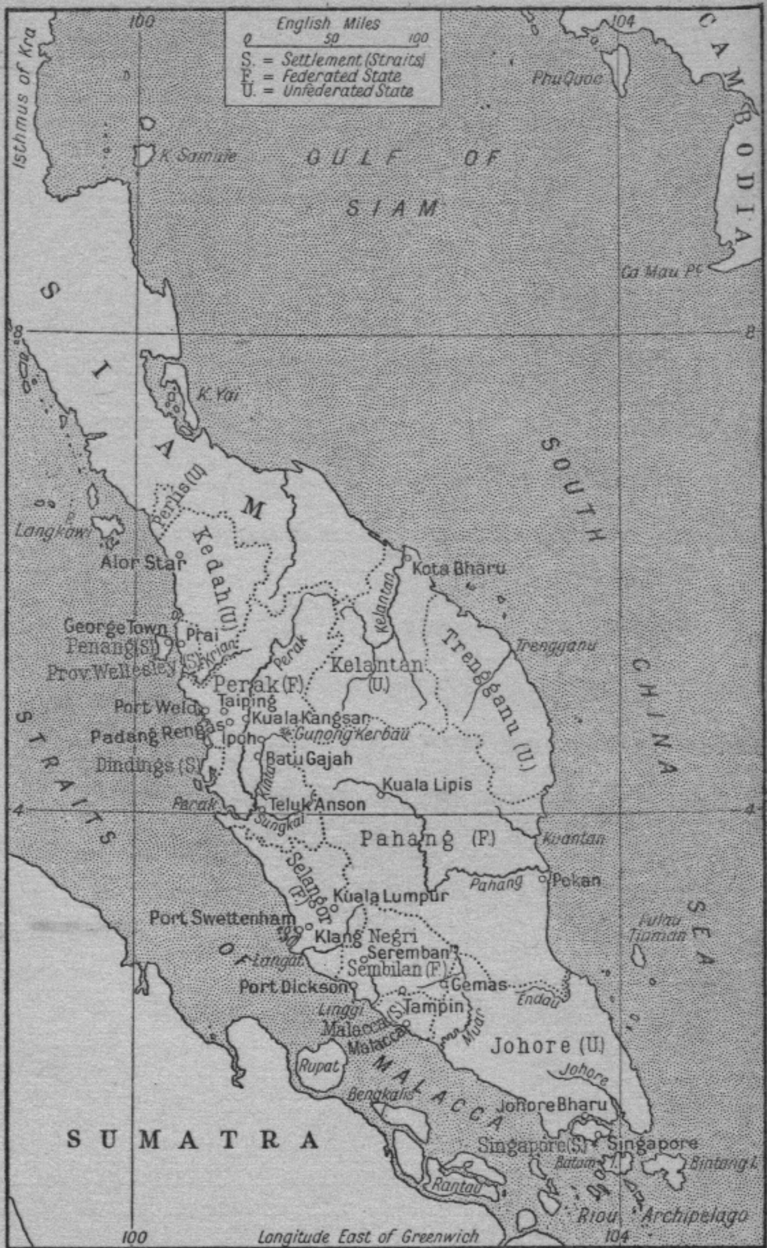
SKETCH-MAP OF THE MALAY STATES