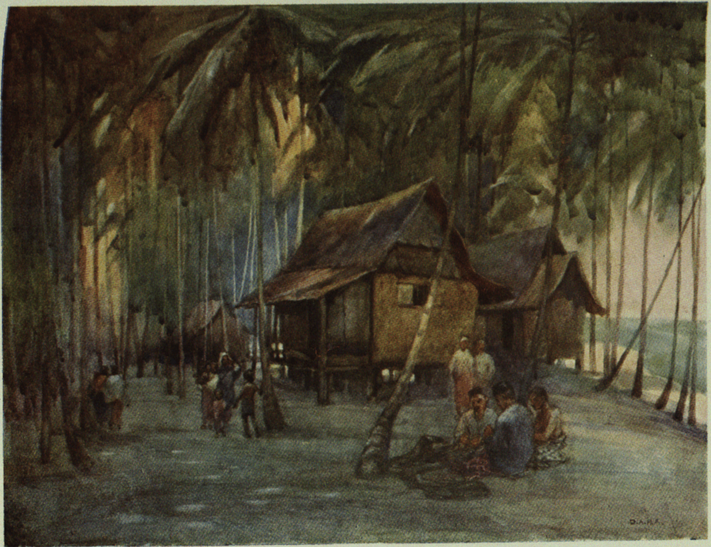
EVENING IN A MALAYAN FISHING VILLAGE.