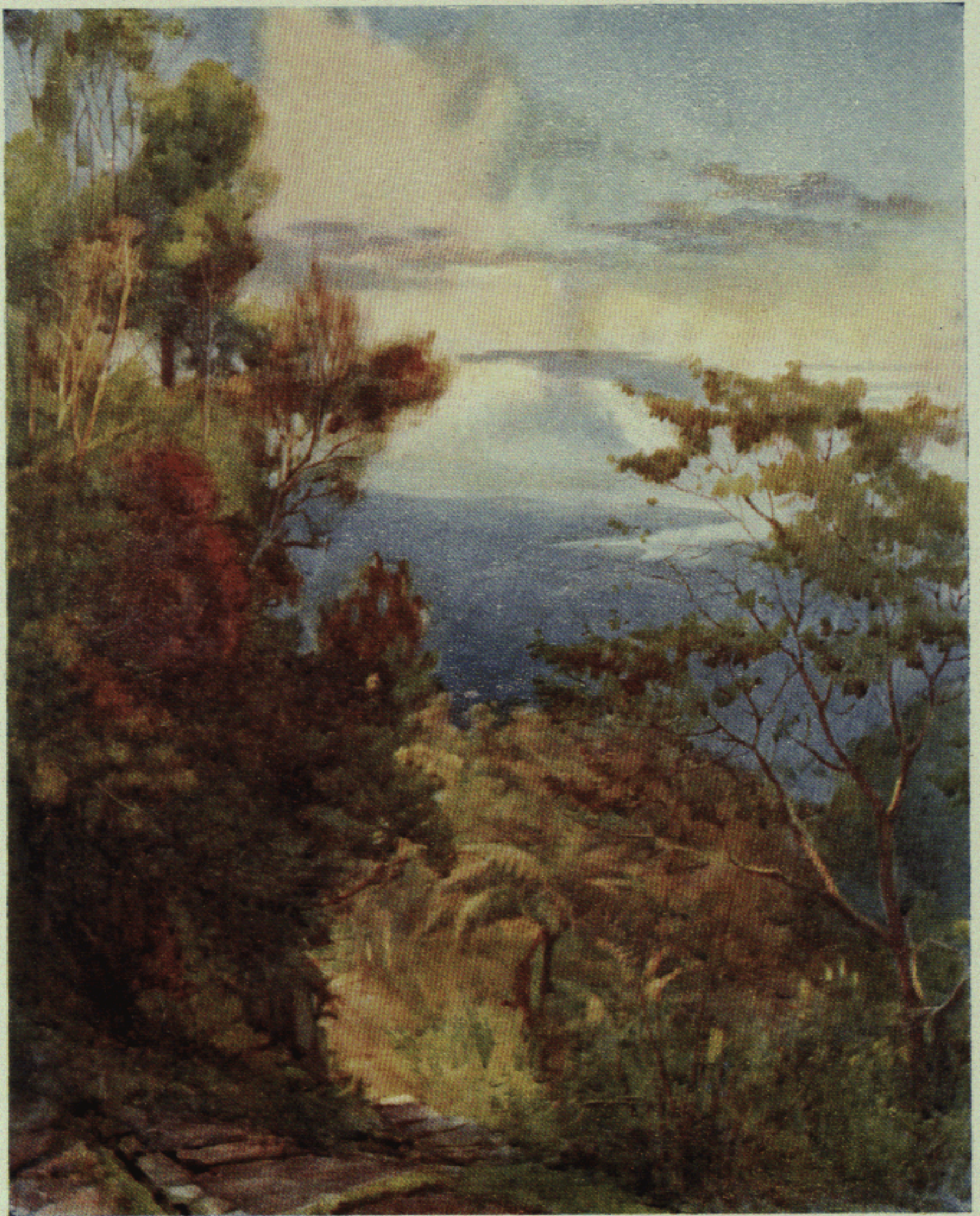
LOOKING OUT TO SEA FROM TAIPING HILL.