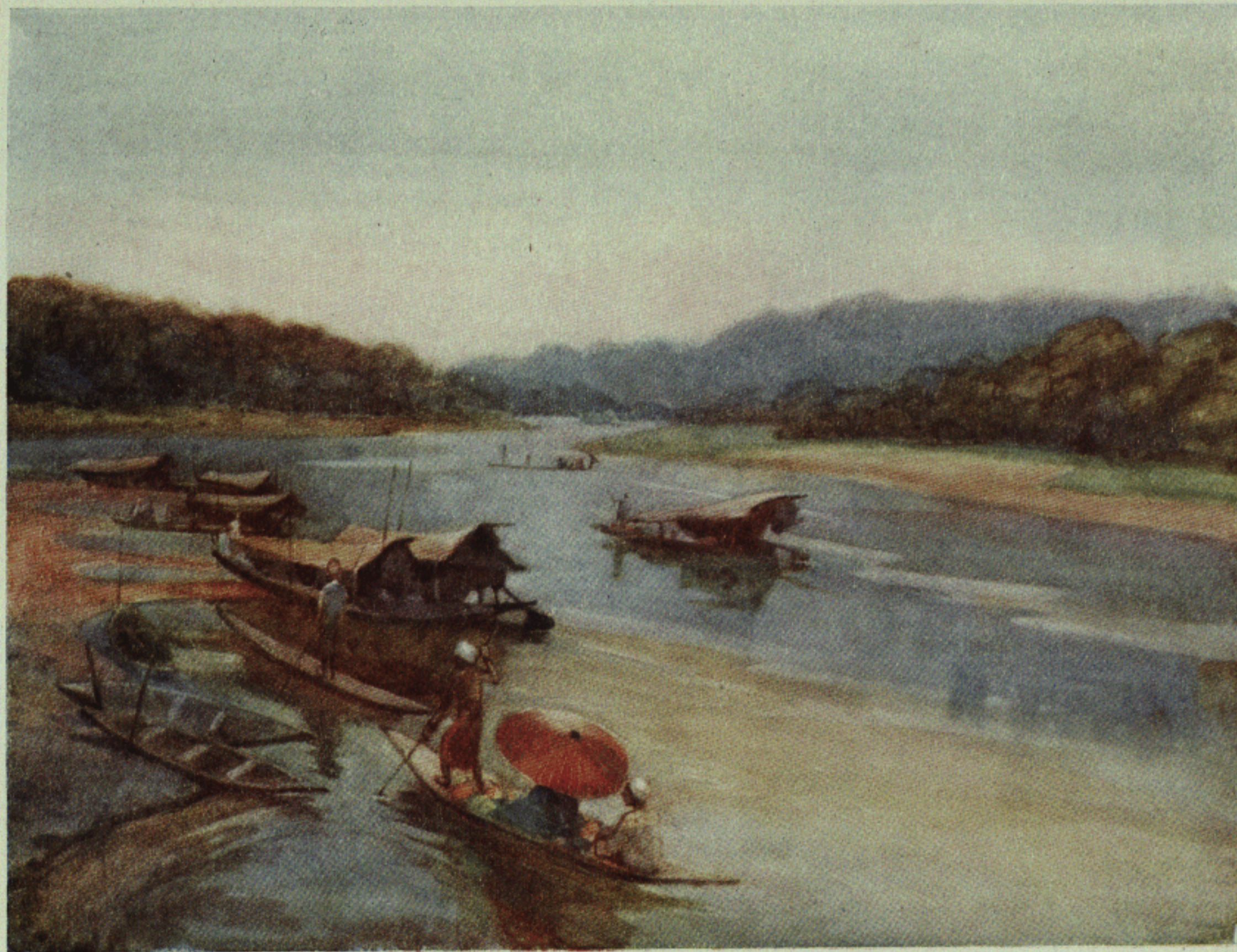
HOUSE-BOATS AND DUG-OUTS ON THE PERAK RIVER AT KUALA KANGSAR.