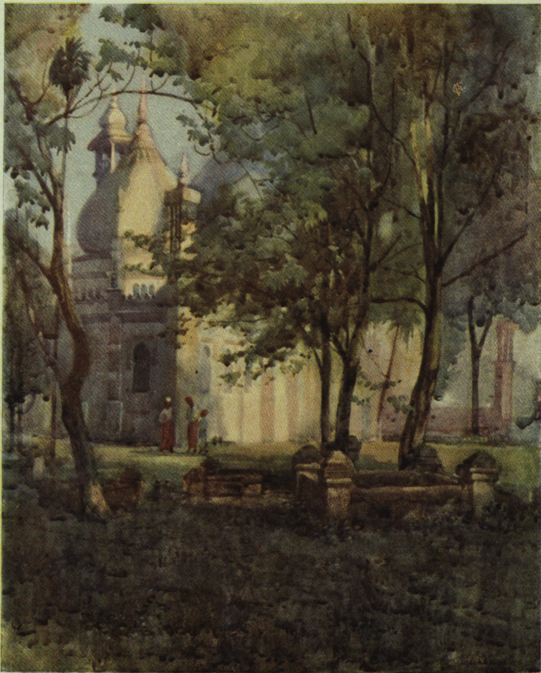
THE MOSQUE, KUALA LUMPUR.