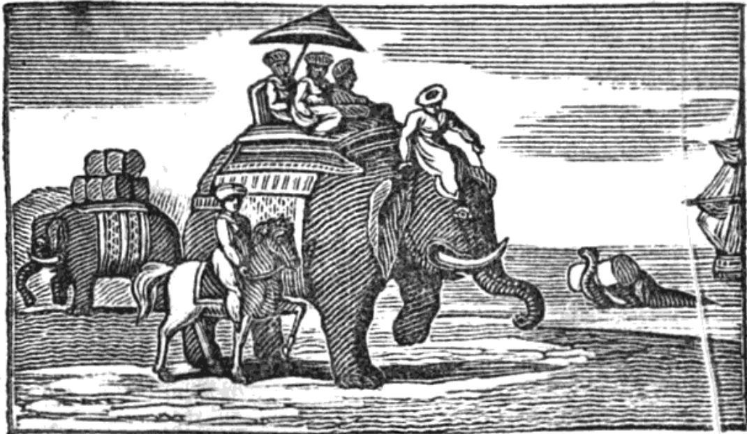
Elephants carrying burdens.